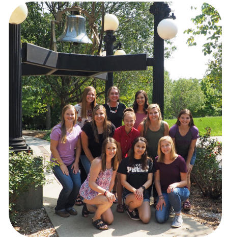
2019-2020 Tomorrow's Teacher Scholarship Recipients